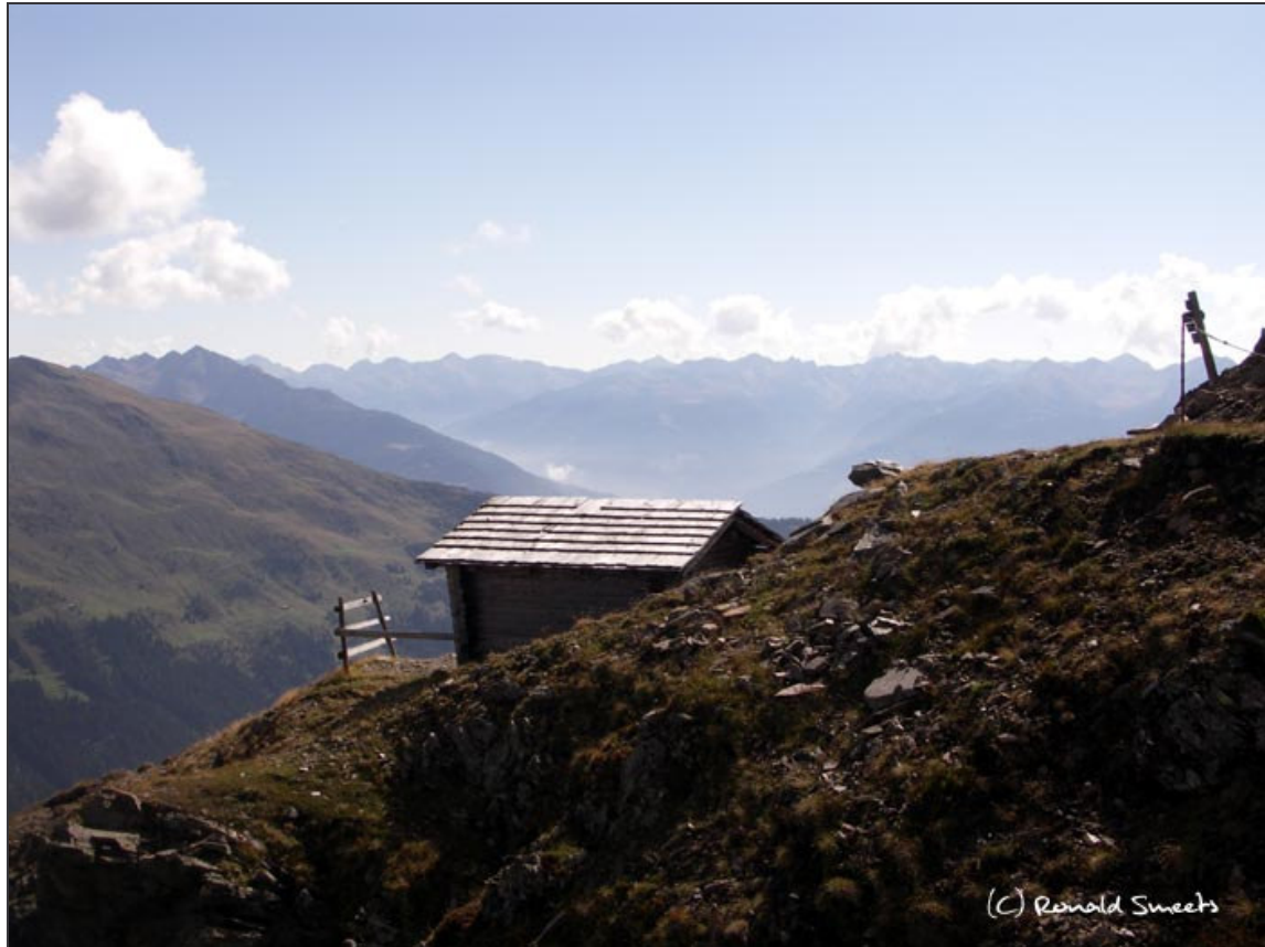
Small hut on our way ...