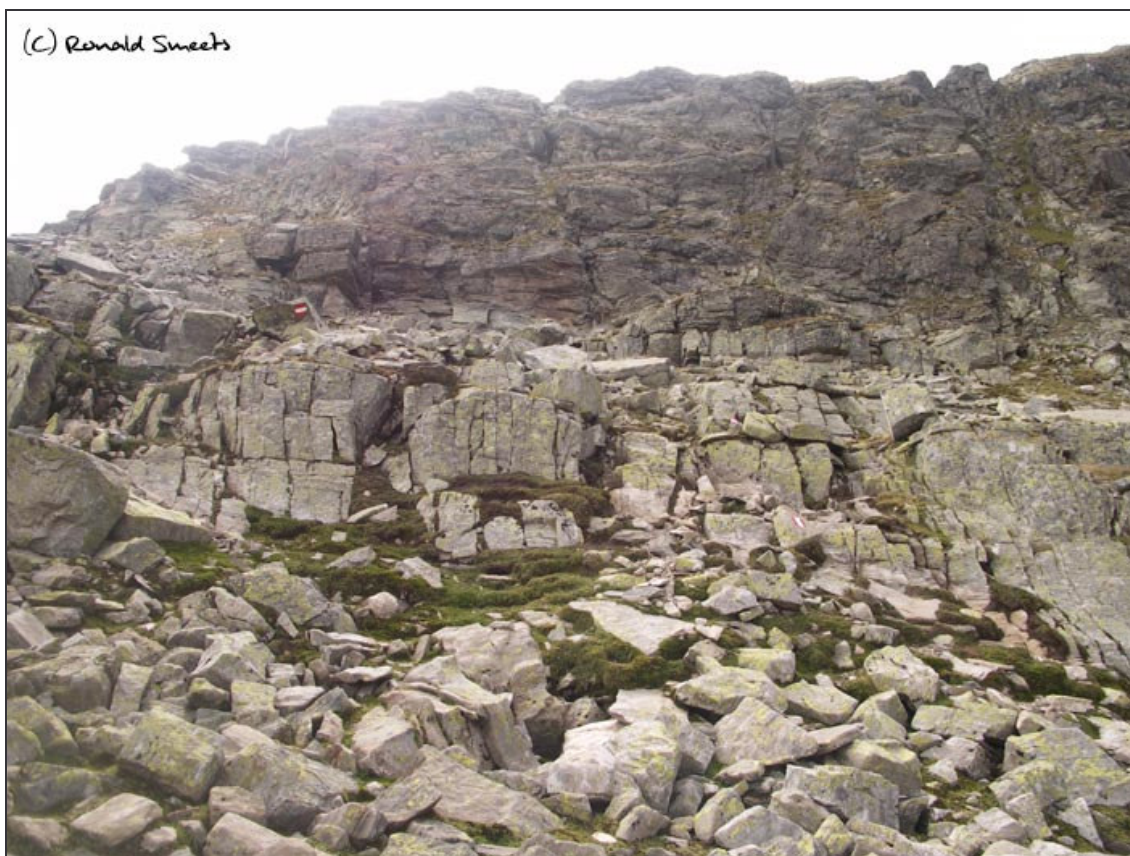
The immense rock piles...