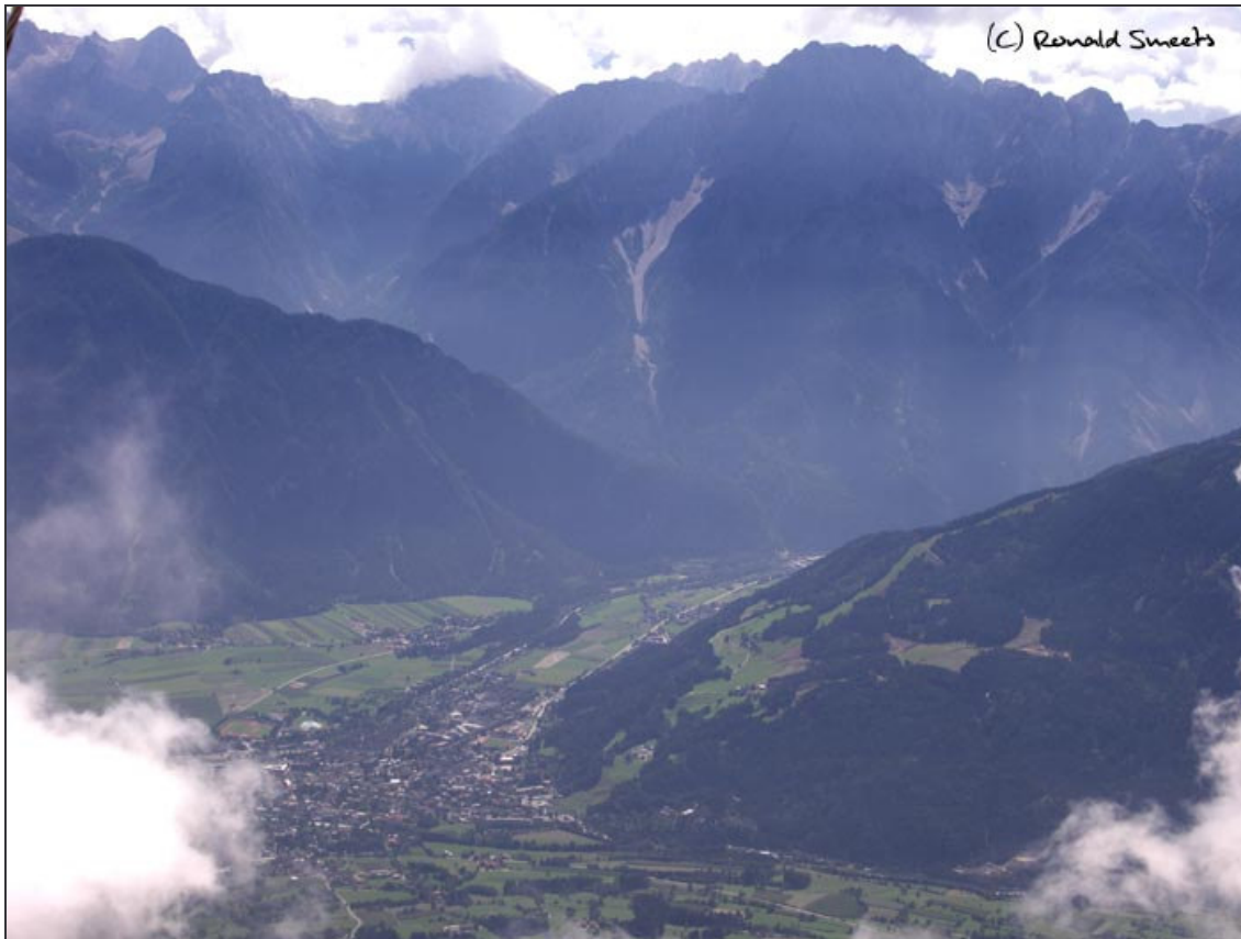
Spectacular view of Lienz