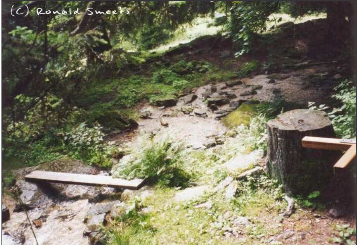
Sometimes you get a little help :)