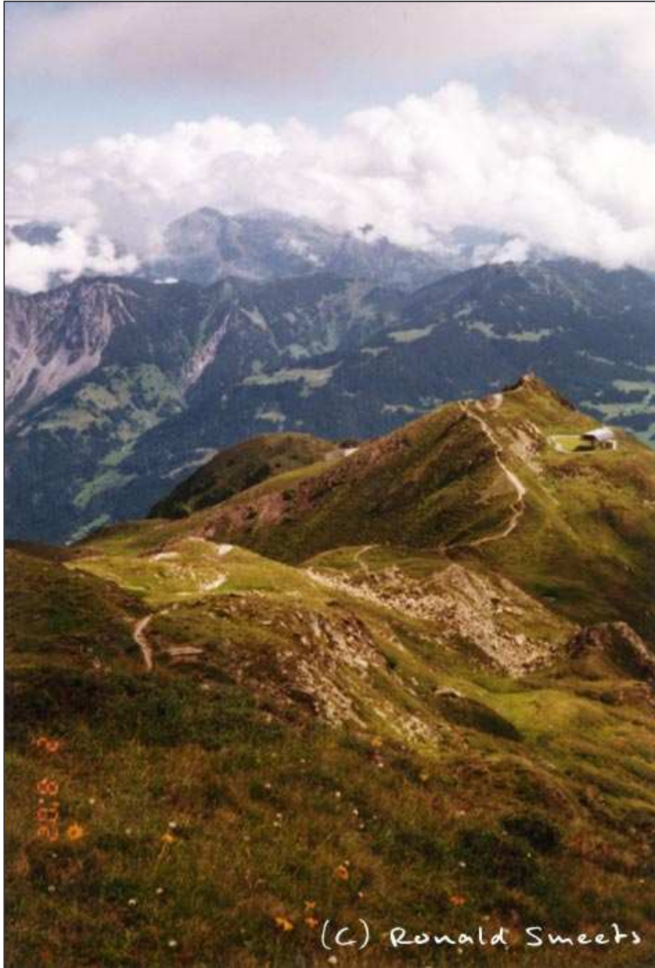
Part of the 'Höhenweg'