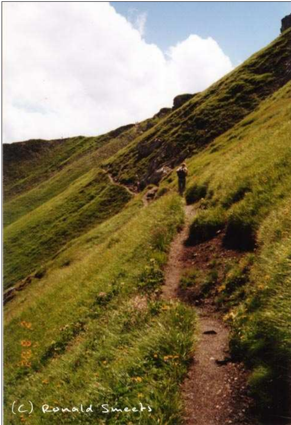
Just before the ridge towards the summit of the Geiss Spitze