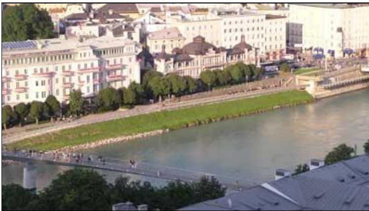
View of the Salzach of Mönchsberg

Oh yes, our route to Salzburg: via Mittersill – Pass Thurn – Kitzbühel – Sankt Johann in Tirol – Lofer – Salzburg .