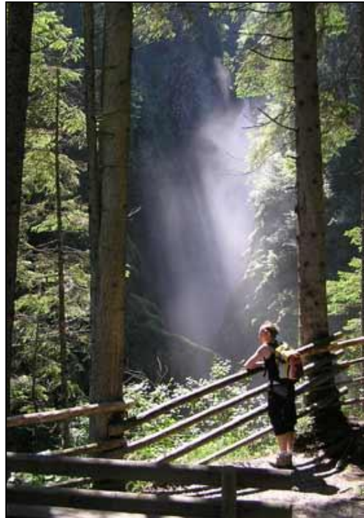
The sun rays through the trees with a view of the waterfall ...