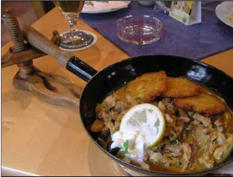
My last meal in Austria this year ...