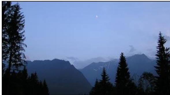
A beautiful evening picture of the Hohe Tauern ...