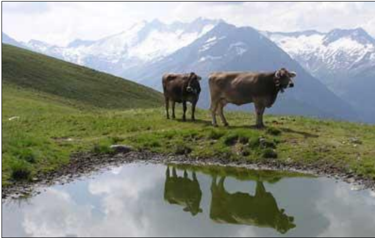
Our company towards the Sattel Scharte

After the tour we also visited an old ruin in the neighbourhood ( Ruine Hierburg ). Than we went to the store to do our last groceries.