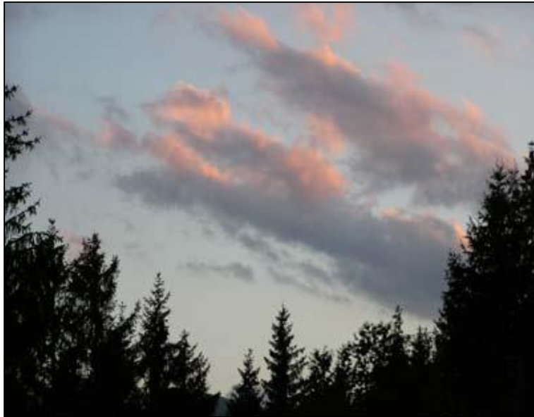
The beautiful evening red clouded sky

Upon arrival at the mountain station and time to spare we decided to climb the Wildkogel itself. The road signs said: 45 minutes to the top ... well, being a little sportive, in a good 30 minutes we had reached the top. Looked around for a nice bit and then back to the Wildkogelbahn at an easy pace. First drank a Cola at the present restaurant and sat in the sun, viewing the high tops of the Hohe Tauern with a map in our hands.