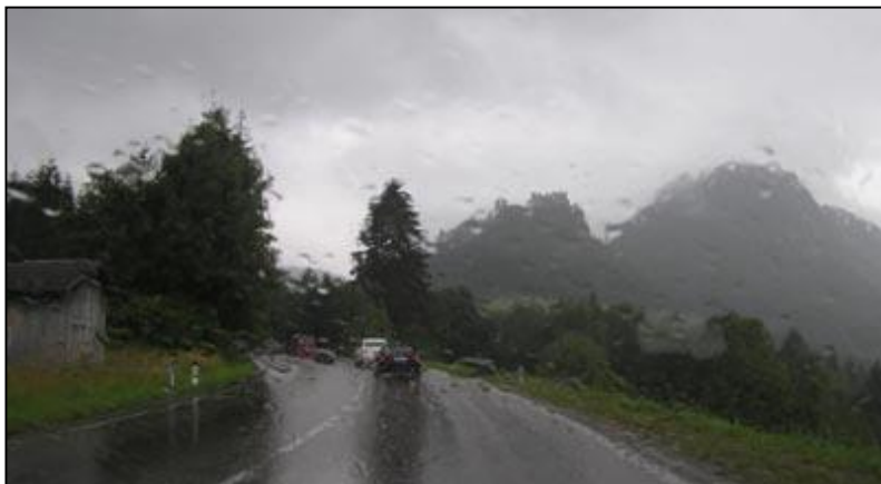
Rain and traffic jam! Can it get any worse ? ;-)