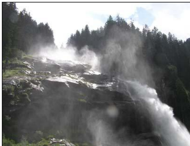
They indeed were very impressive ..

The car was parked in the village Krimml itself, since the 4 parking lots next to the leading road were as good as full. Luckily there was a small parking lot in the village where we found some space. Then first to the cash register, then on to the lower waterfall (also see picture). Very overwhelming violence of nature, those waterfalls!