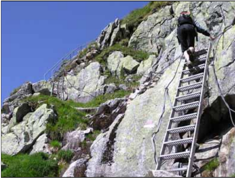
This is what we do it for ;-) .. nice easy climb, well marked.

With the Rudolfs bergbahnen up to the Weiss See. Then descended by foot to the northern dam and crossed it. Then the fun climb started past a steep wall with the help of 'drahtseilen' and 'leitern'. The picture shows my girlfriend in action :-)