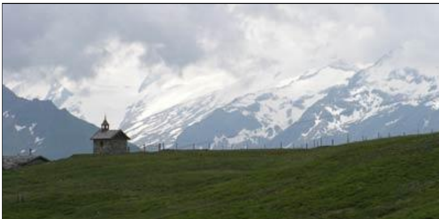
View of the tops of the Hohe Tauern, partly shrouded in clouds.

From the Frühmesser in north-east direction (partly steep) decent over loose stones to the Herrensteig Scharte (2028m.) and here walked back around the Frühmesser to the mountain station of the Wildkogelbahn (good small mountain paths past the flank of the Frühmesser and through alp meadows). We continuously kept a nice view of the Kitzbüeler Alpen (With Grosser Rettenstein ) as well as the high tops of the Hohe Tauern .