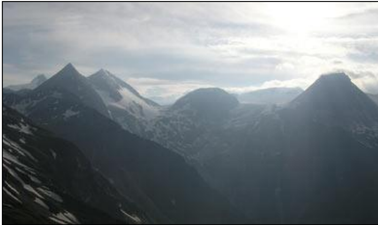
The setting sun gives beautiful pictures ...