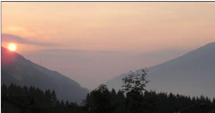
Morning glory in Neukirchen.

Around 6:15h I was able to take this beautiful morning picture: