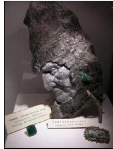
Face in stone ...