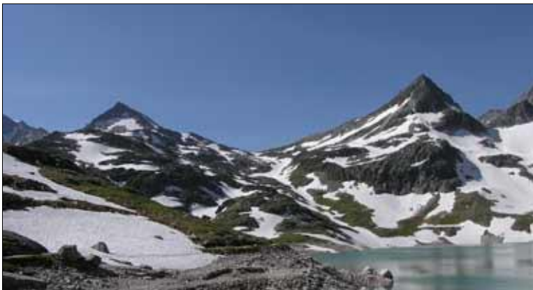
The beautiful Weiss See and the Medelzkopf (left)

Then it went further a little less steep up, towards an Ombrometer at about 2500 meter height, over many snow plates.