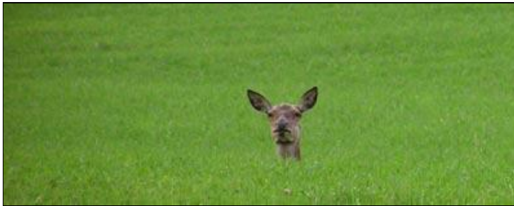
They grow out of the grass ... and no, it isn't effects!

After 4, one after the other, busy days, we decided to just do nothing on the Sunday ... although, I did watch the DTM race on TV and we played some games (Yahtzee en Rummikub). During the evening we made some pictures of the surrounding area. The weather was again great around 25 degrees, clouded yet sunny.